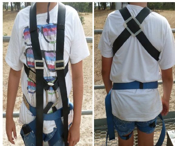
Rule for Vertical logos: "White Right" (White vertical labels should be on right site)